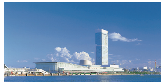
Hotel Nikko Niigata

TOKI MESSE Niigata Convention Center, JAPAN